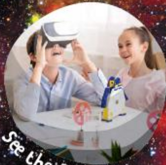
See the Stars